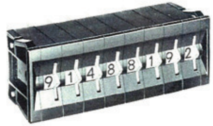
T75 LIGHTED THUMBWHEEL

Available in 8, 10, 12 and 16 positions and a wide variety of output codes. Can be furnished with extended PC board to provide mounting of other components. (See page 5.) Stops may be inserted at factory or in the field to control dial rotation. (See Page 7.)