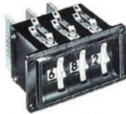
T20 LIGHTED THUMBWHEEL

Indicated by third digit of suffix. For example: T20-02 "L". See page 5 for details.